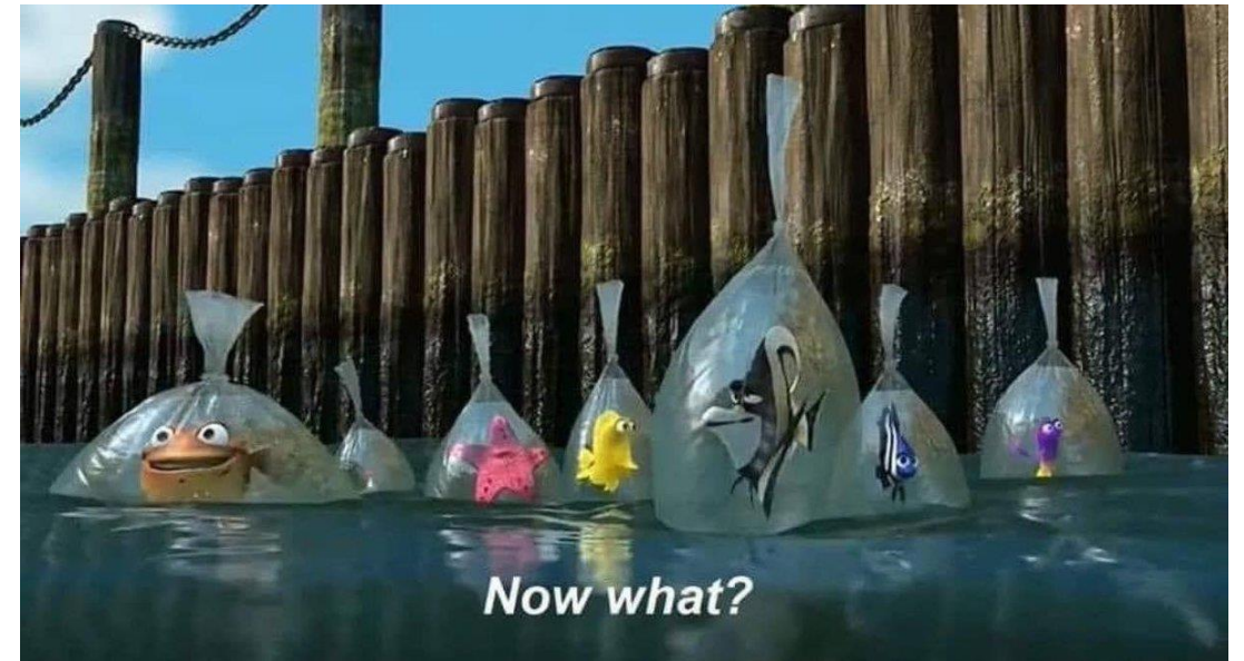
Screenshot from "Finding Nemo" (2003)